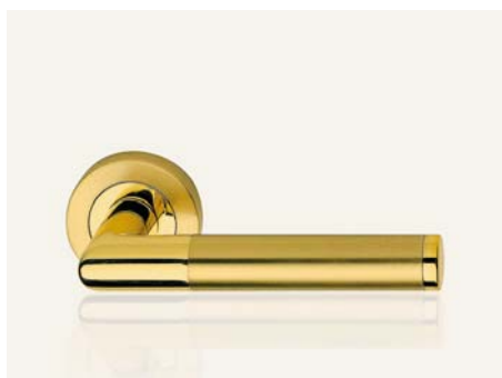
OT ottone satinato + ottone lucido satin brass + polished brass mix