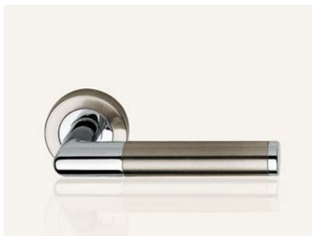
CN nickel satinato + cromo satin nickel + polished chrome mix