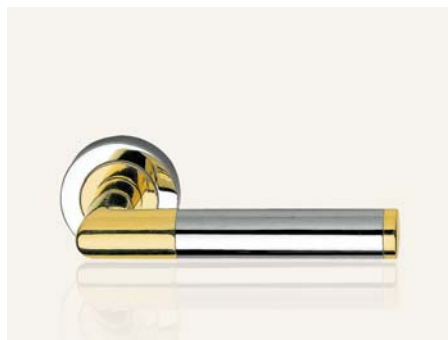
OC cromo + ottone lucido chrome + polished brass mix