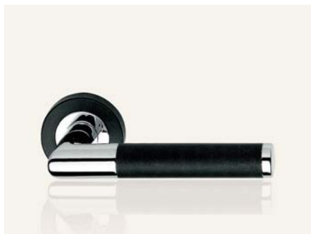
CE nero opaco + cromo matt black + polished chrome mix