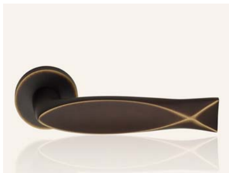
BM bronzo opaco matt bronze