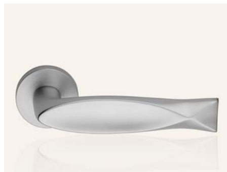
CS cromo satinato satin chrome