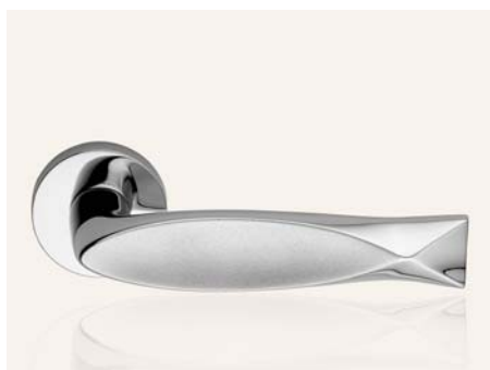
MC cromo + cromo sabbiato chrome + matt chrome mix