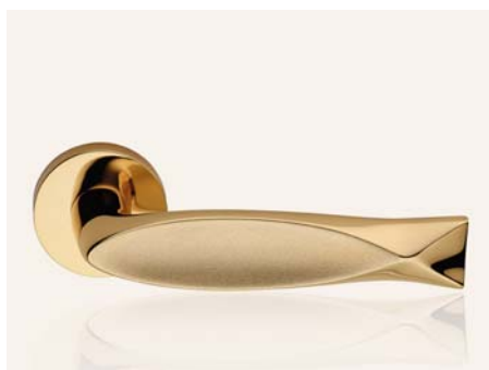
OM oro + oro sabbiato polished gold + matt gold mix