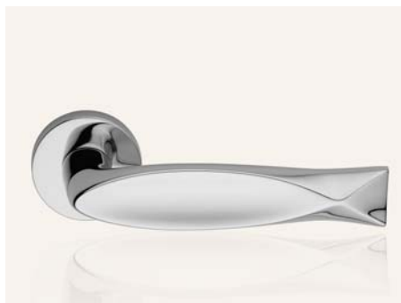
CR cromo lucido polished chrome