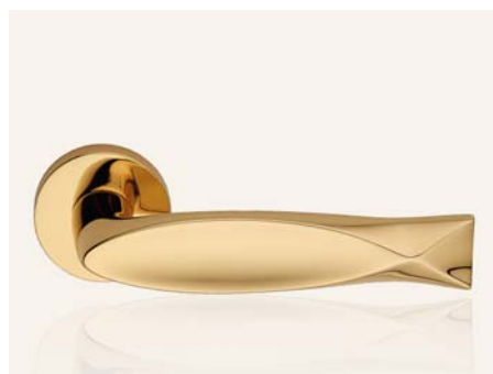
OZ oro zecchino gold plated